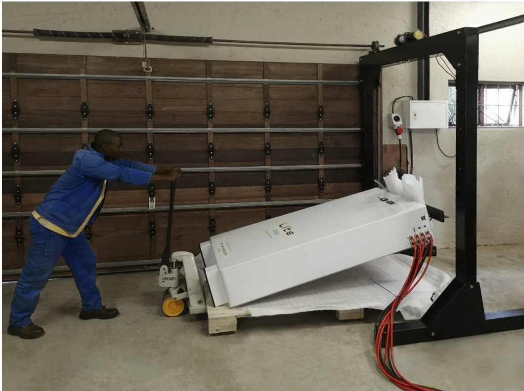
Fig 4.5 Site Assembled Gantry with Electric Hoist