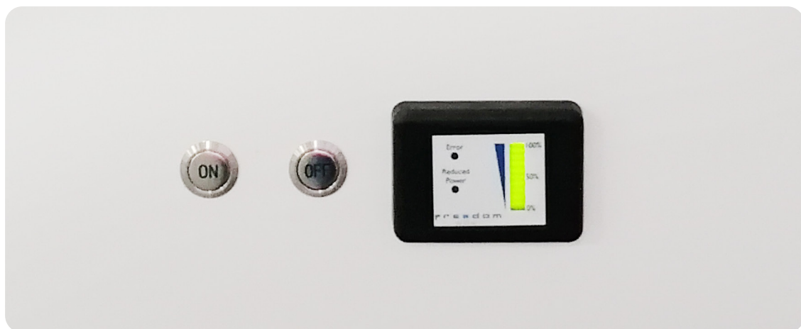
Fig 7.1 "ON" and "OFF" Buttons

To switch off the DC output from the LiTE, pull down the breaker. To switch off the power to the BMS, press the "OFF" button situated to the right of the "ON" button. This will also trip the breaker if it is still on at the time. The LiTE must be switched off fully when not in use to prevent self-discharge.