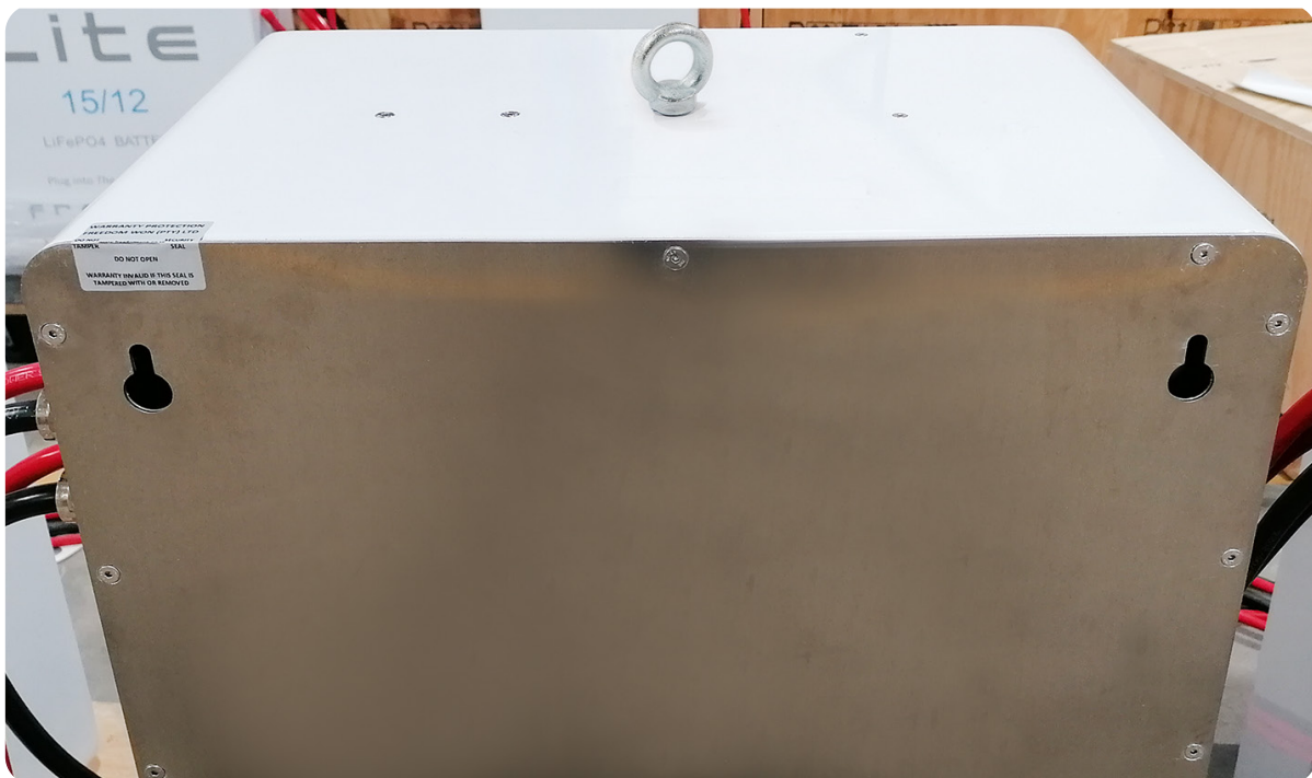
Figure 4.1 Bolt Mounting Keyhole on Rear of LiTE Casing – floor mount retaining tab and fitted eye bolt also visible

Eye bolts fixed to the top of the battery can be used for hoisting the unit up to the required height for fitting to the wall. The eye bolt on the models up to the LiTE 20/14 can be removed after installation. Ensure that you have one M12 x 1,75 thread eye bolt rated for 450kg or more for the models that are not supplied with permanently fixed eye bolts.