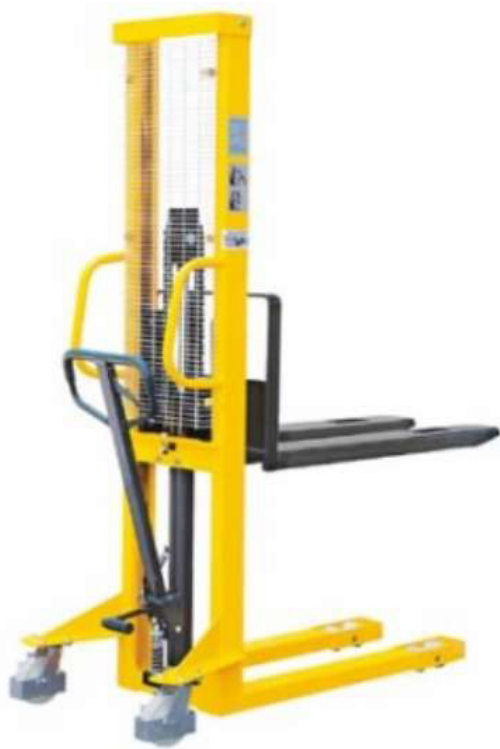
Figure 4.4 High Lift Pallet Jack

Models up to LiTE Home 20/16 are fitted with lifting or manoeuvring handles to make placement easier. See Fig 5.1.