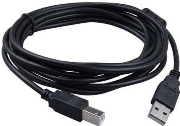
Figure 2.2 USB “printer” Cable for Programming all Freedom LiTE models produced after May 2020

The ON button [11] and OFF button [12] are located beside the SoC display.