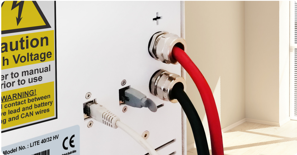
Figure 4.2 Picture showing 2 x RJ45 Sockets for CAN Bus, the DC cables, High Voltage warning label, model specifications label